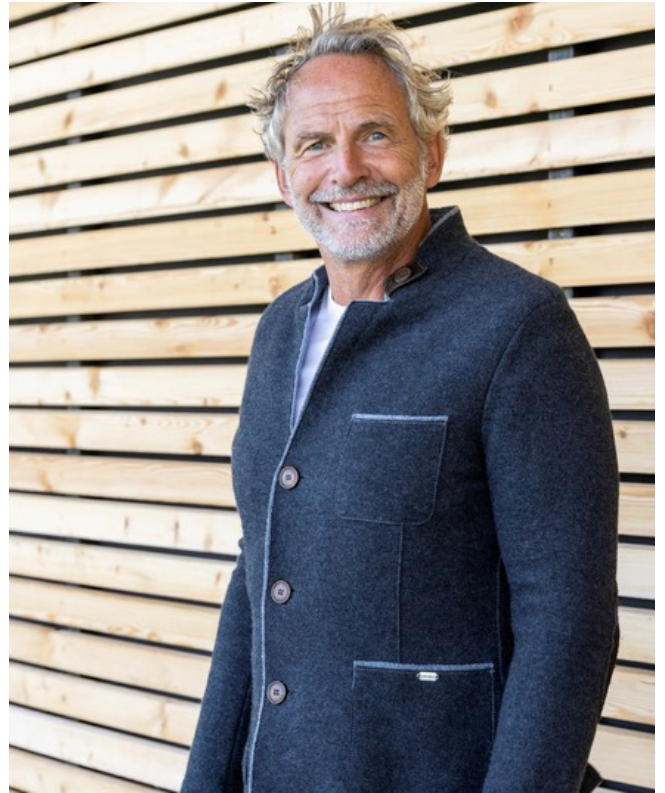
ALPENSTYLE GEIGER 60020 PIPING AND LEATHER TRIM JACKET NAVY 9056, SIZE AUSTRIAN 50, U.S. SIZE 40

A LIGHT WEIGHT, PRACTICAL JACKET TAILOR-MADE FOR WEEKEND WEAR!