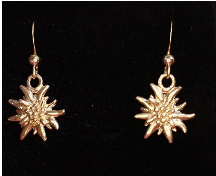
14K GOLD EDELWEISS EARRINGS FROM BNA CUSTOM.